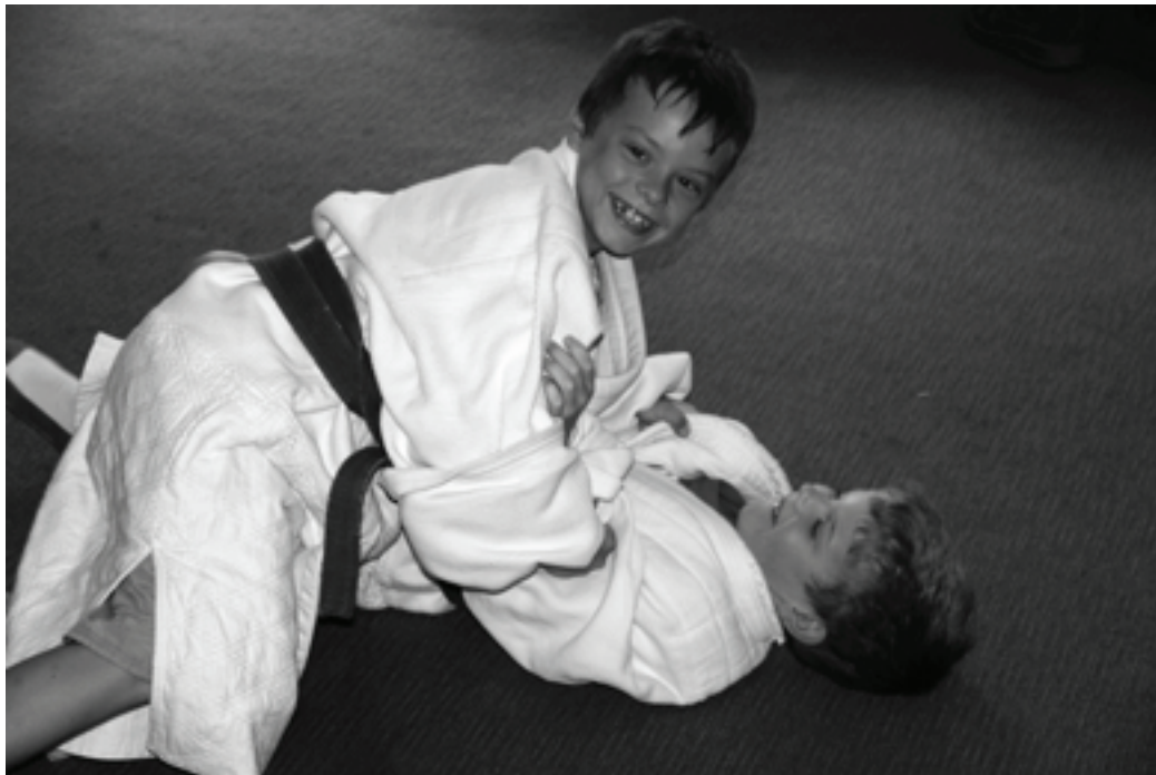
Scout Law #4 "A Scout is a friend to all and a brother to all scouts."