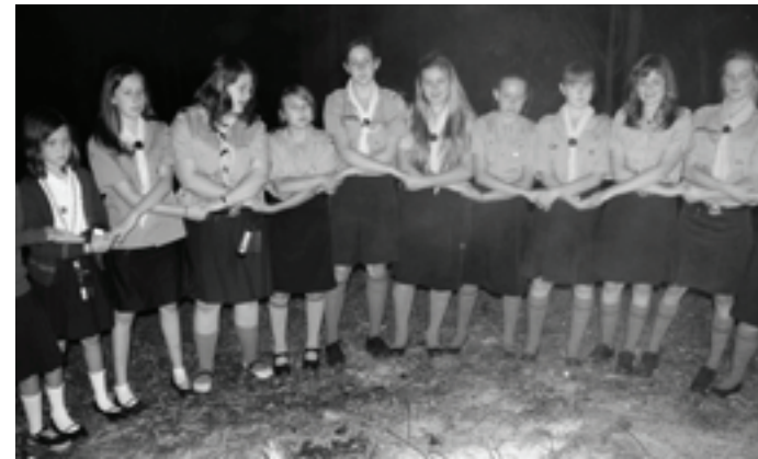
Closing the Circle of Friendship at our Campfire on first night at Camp.

During swimming we were all happily jumping off the edge of the pool into the water either together or one after the other like lemmings.