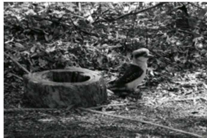
Kooka on the court, Patrol mascot of the Kookubarra's, keep an eye on things at the freshly cleared Volleyball Court.