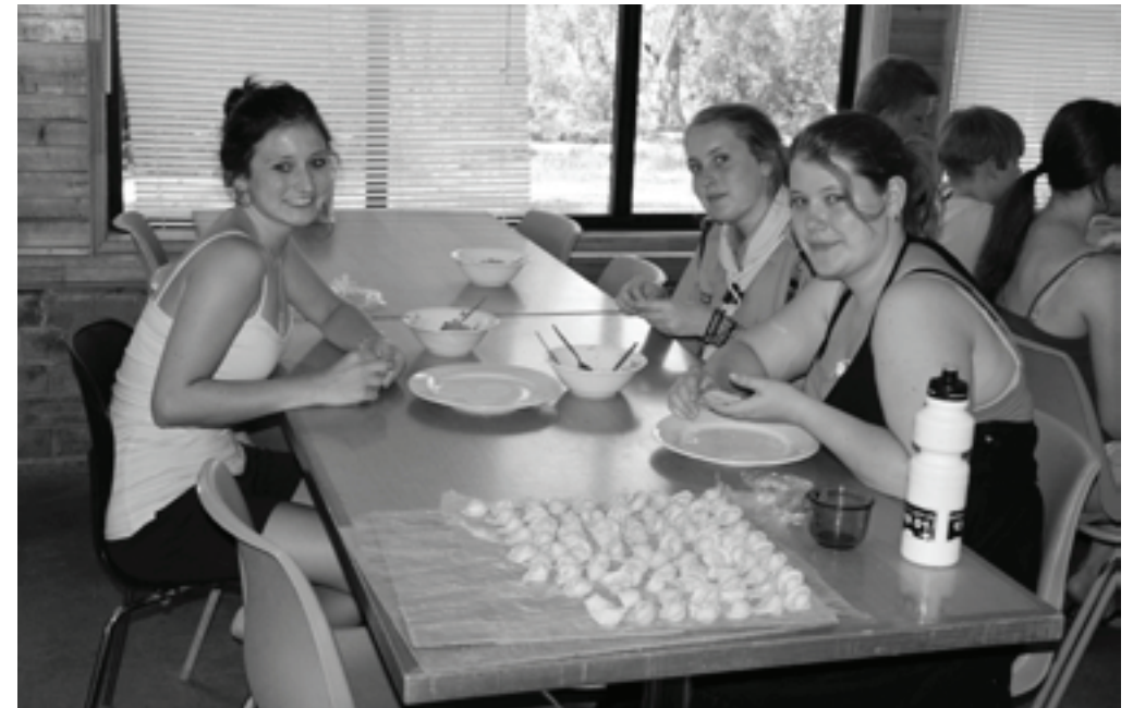
Pelmeni are a traditional Russian food for Old New Year feast. Here are our senior guides making them.

Opinions were mixed among scouts, some annoyed for being woken-up, others wanting to do this every night. The senior patrol decided to follow the latter option.