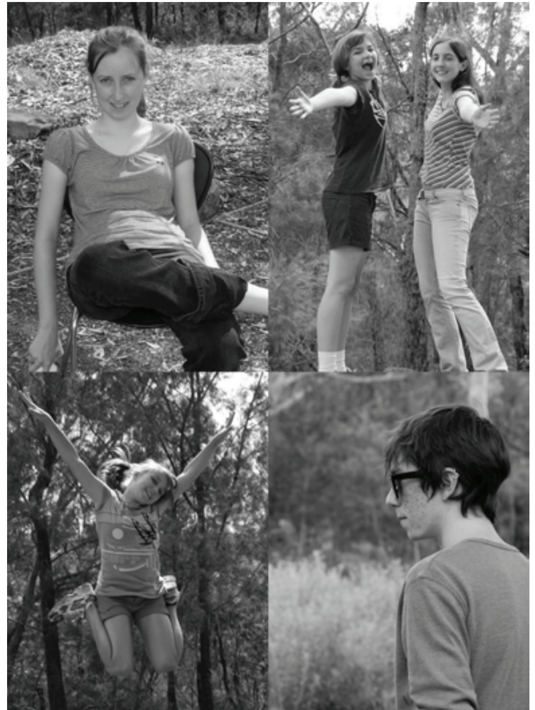
Photo Class makes everyday people look interesting.